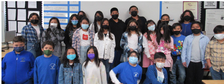
MESSAGE FROM THE PRINCIPAL FEBRUARY 9, 2022

***** Graduates of Immaculate Heart of Mary strive to become: Children of Citizenship and Community